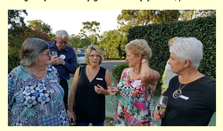
The WAGs (and a minder) doing what WAGs do.