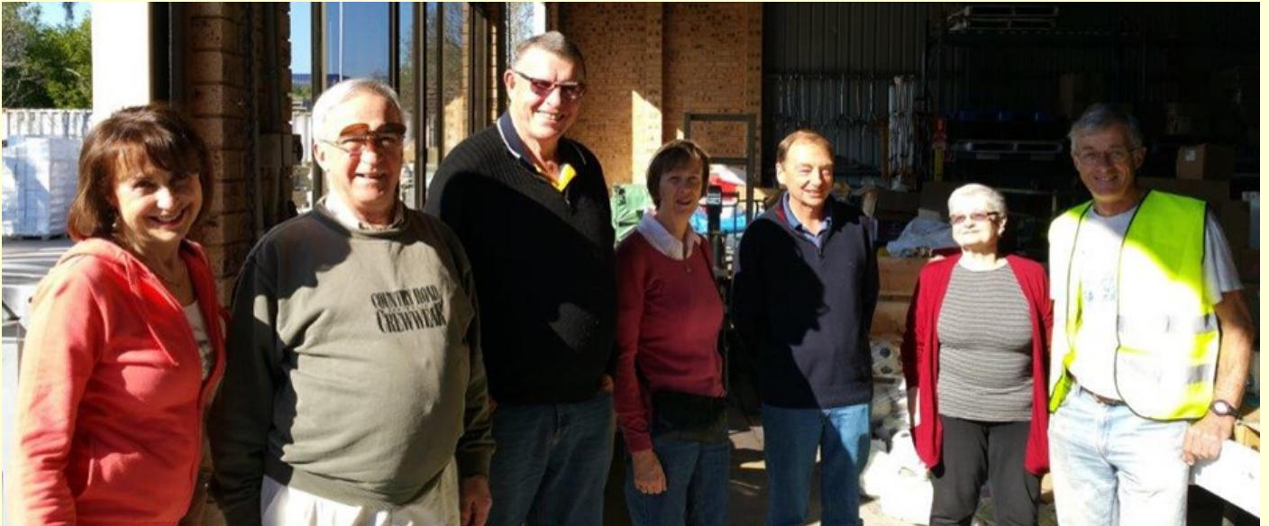
Ready for action (before the pullovers came off)