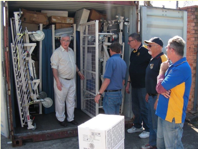
How many Rotarians does it take to fill a container? Answer: 1 (plus 4 supervisors)