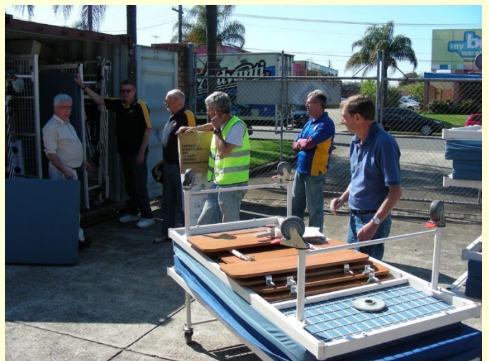
Fit 10 more beds in? No problem!