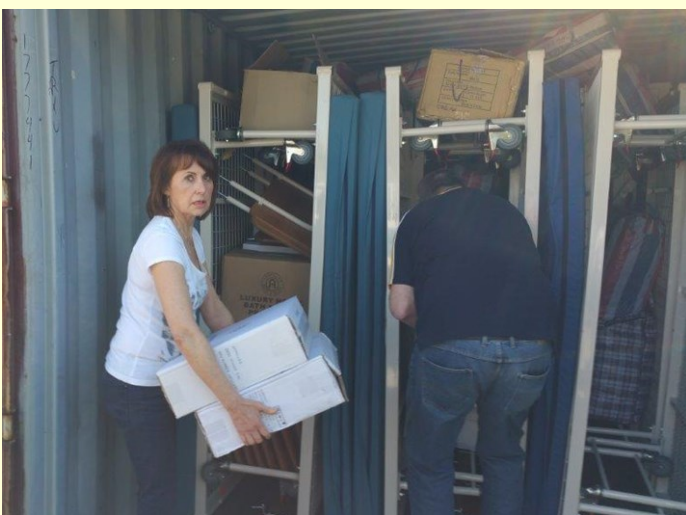
I think he's stuck in there!