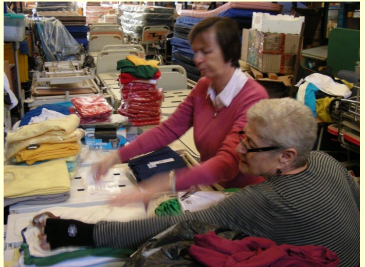
T shirt graders