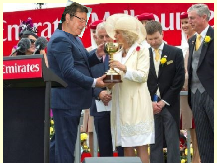
Dreams are made of this