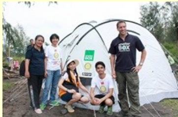
Shelterbox in the Philippines

This month's quote comes from Anne Frank. "No one has ever become poor by giving."