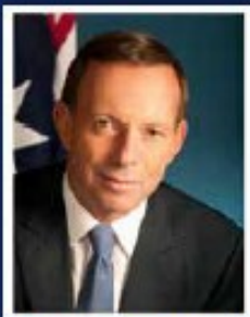
The Hon Tony Abbott MP Prime Minister of Australia

Tony Abbott was sworn in as the 28th Prime Minister of Australia on 18 September 2013 having served as the Member for Warringah since 1994 and Health Minister from 2003-2007.