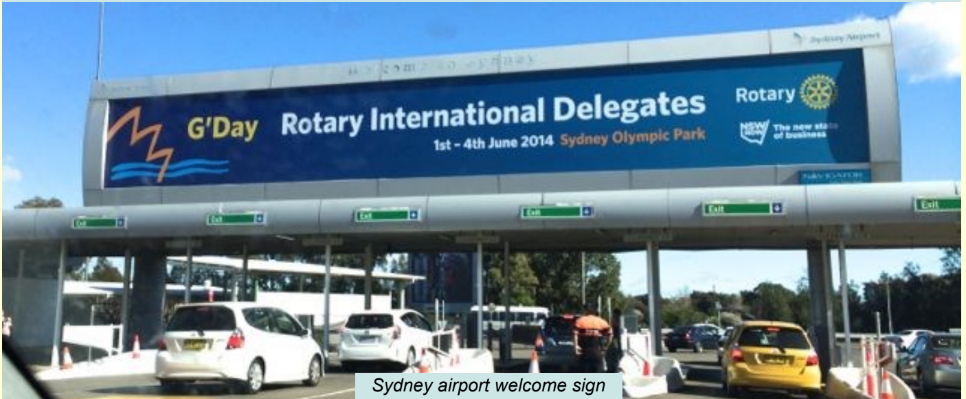
Sydney airport welcome sign