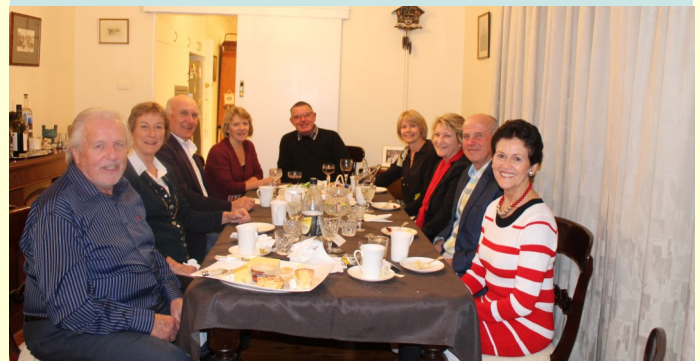
chez Braid – plus 25% (incl. photographer)