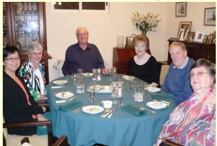
chez Hungerford – minus 12.5% (incl. photographer)