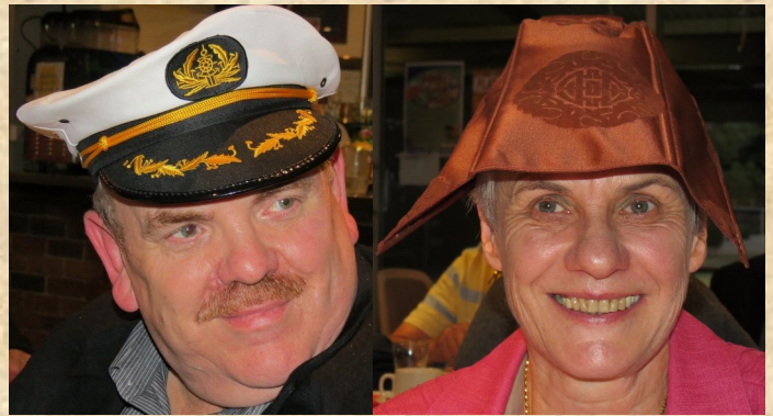
"Are you really a monk?"