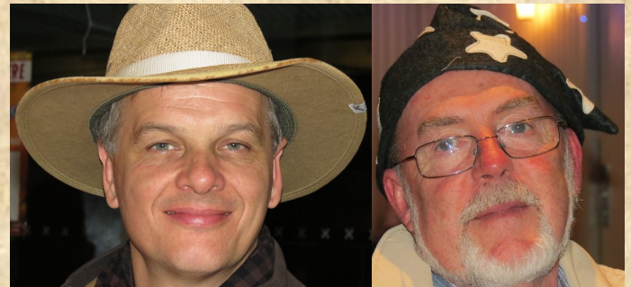
"Hey, that's my revolutionary cap!"