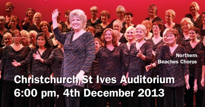
Northern Beaches Chorus

Christchurch St Ives Auditorium 6:00 pm, 4th December 2013