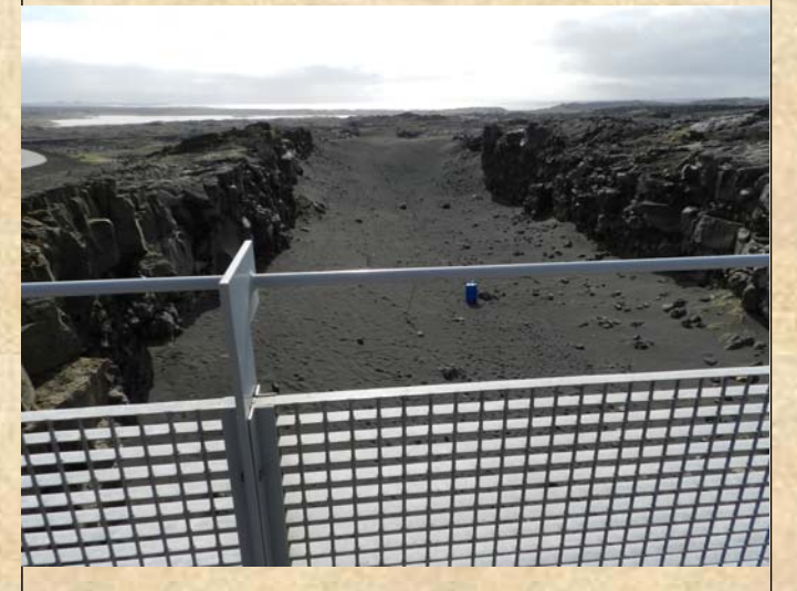
Tourists took bags of dust away as souvenirs.

Streams turned into mud flows. Rivers rose several meters.