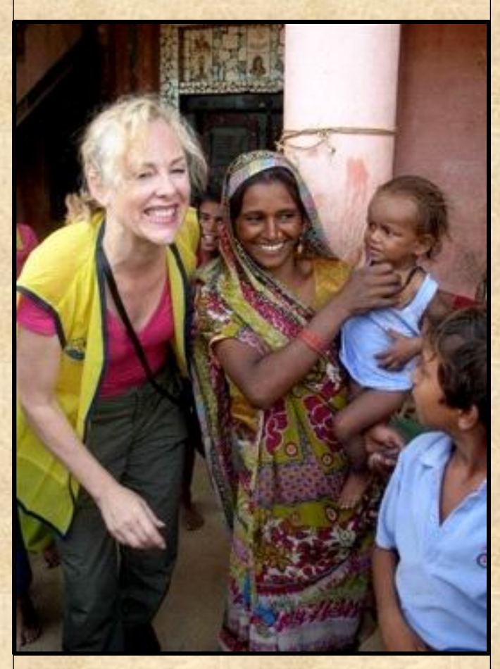
Some current victims

A Rotarian in Bowral who has been administering vaccine in India