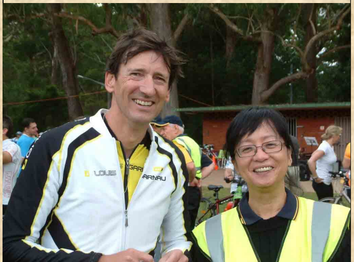
Some of 15 of the largest Team— Rode Duivels