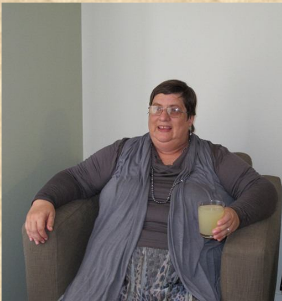
A masked group