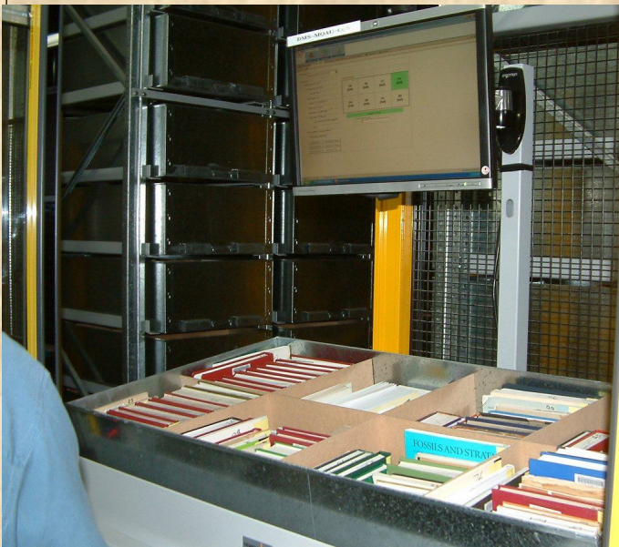
One of the rows of metal containers

A metal container full of books for the operator to select