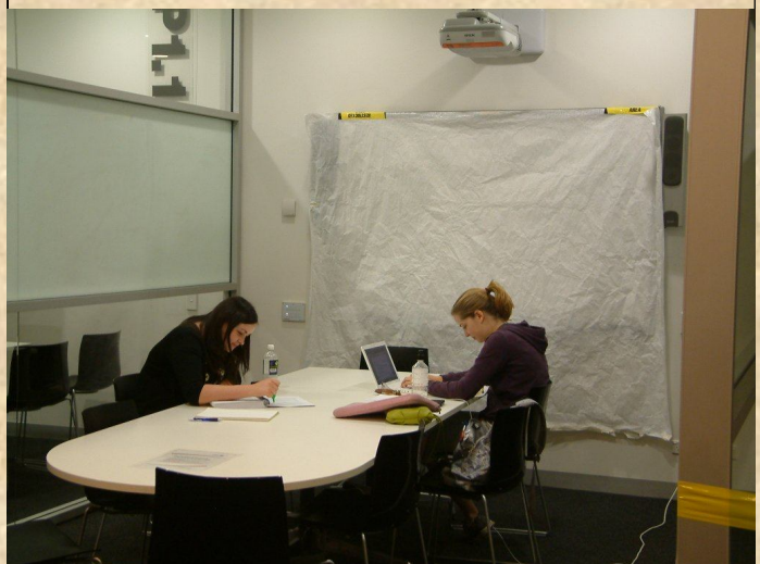
Governor Macquarie Historical Room