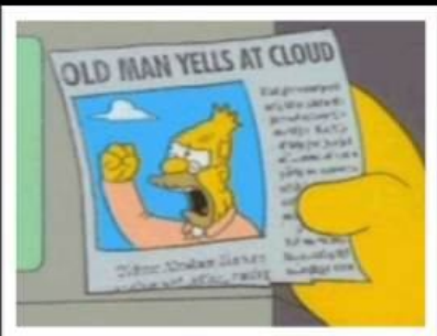
What young people think I do