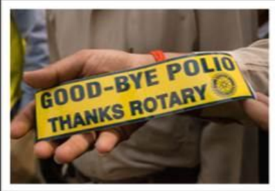
What my family thinks I do