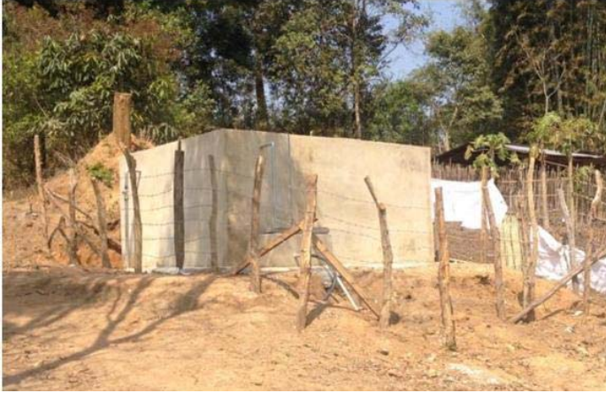
Village Water Tank