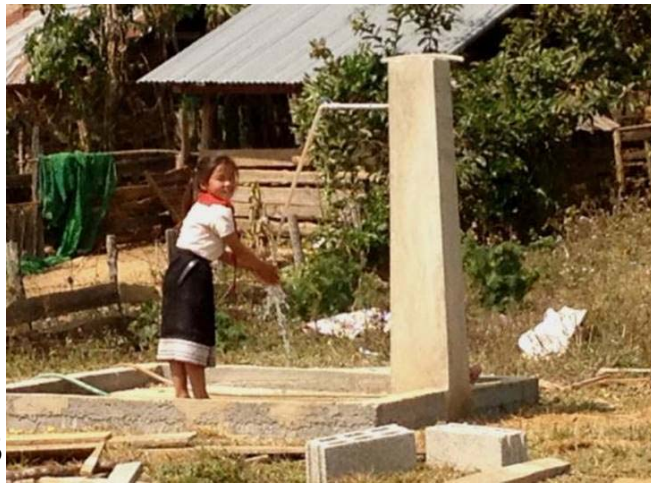
Student washing herself at water point adjacent to school