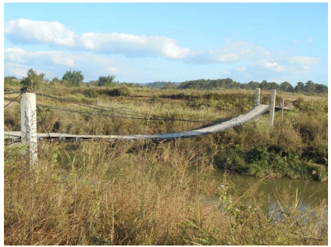
Pipeline River Crossing