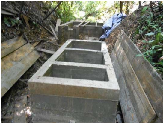
A headworks settling tank nearing completion.