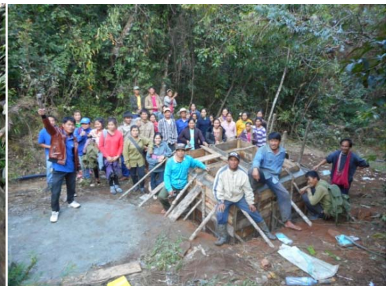
Building the village water tank