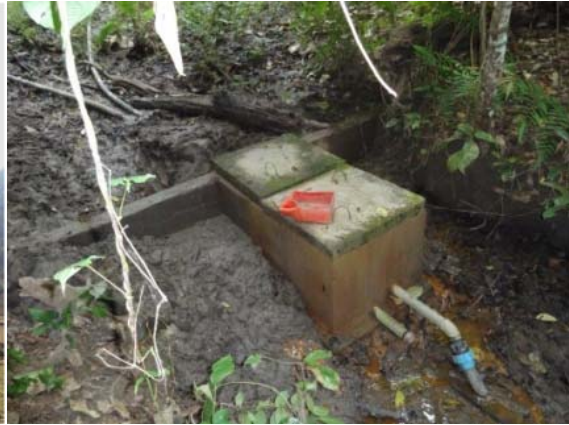
The Source Works