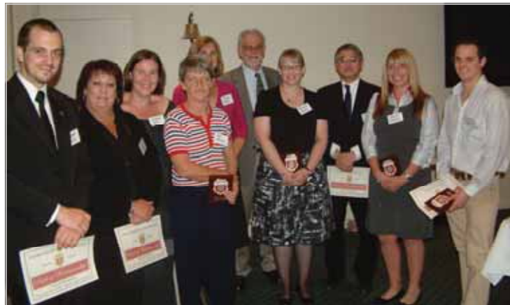
Names of people left to right.

Each awardee received a trophy and their employers were presented with certificates to acknowledge their support of Rotary's Pride of Workmanship Awards scheme.