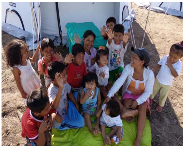
A mother in Peru outside her "home"

RAM provides bed nets to vulnerable communities. Impregnated bed nets which kill malarial mosquitoes are a very effective way of preventing the spread of this dangerous disease. The RAM Committee recently thanked the Club for our long term support. We gave $1,000.